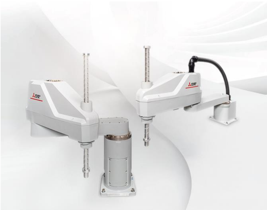
Image: Left: MELFA RH-20CRH, Right: MELFA RH-10CRH. These new robots provide manufacturers with greater flexibility in adopting digital manufacturing while addressing skilled workforce shortages.

Mitsubishi Electric has launched its MELFA RH-10CRH and RH-20CRH SCARA robots, providing manufacturers with greater flexibility in adopting digital manufacturing while addressing skilled workforce shortages. These new robots enhance industrial automation through high-speed operation, easy installation, and exceptional efficiency. Compact and lightweight, they are ideal for manufacturers aiming to boost productivity while navigating space and weight constraints.